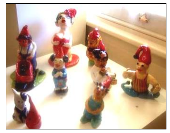
Reinventing the Gnome 2006

Fees may be paid in instalments with the permission of the proprietor. Where students are absent due to sickness or family circumstance, every effort will be made for them to have their full complement of lessons by accommodating them in alternative classes. However, as classes are run, full fees remain due.