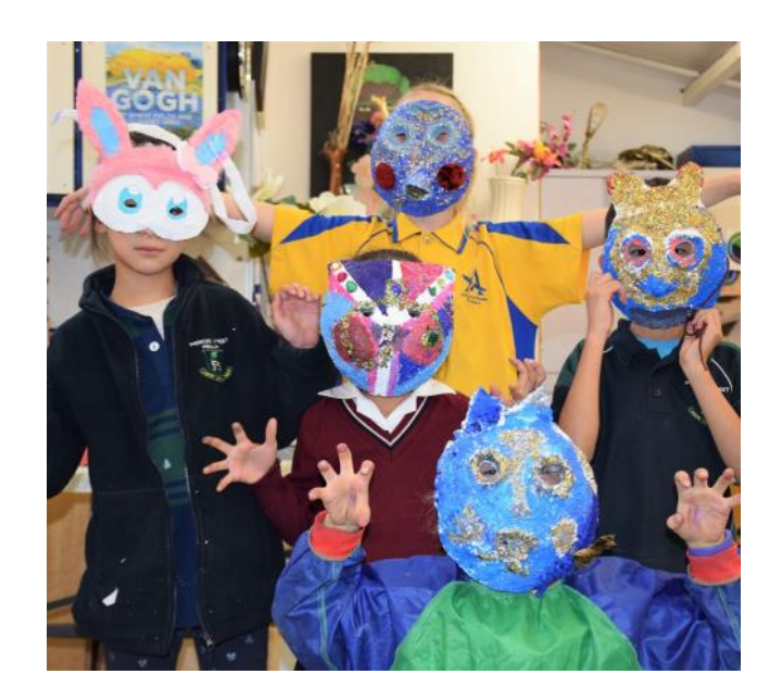
Masks above and below, ceramic portrait heads.