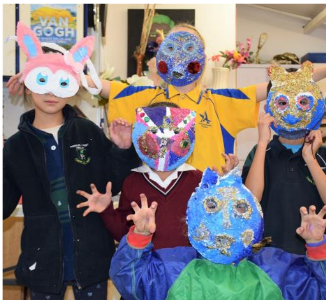
Masks above and below, ceramic portrait heads.