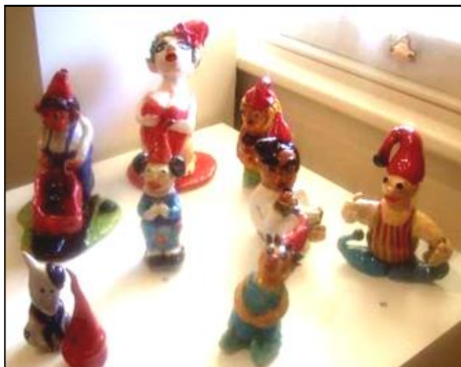
Reinventing the Gnome 2006

Fees may be paid in instalments with the permission of the proprietor. Where students are absent due to sickness or family circumstance, every effort will be made for them to have their full complement of lessons by accommodating them in alternative classes. However, as classes are run, full fees remain due.