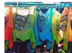
Smocks getting a wash.

Other results are enhanced hand eye coordination, the ability to persevere with a task and increased self-reliance.