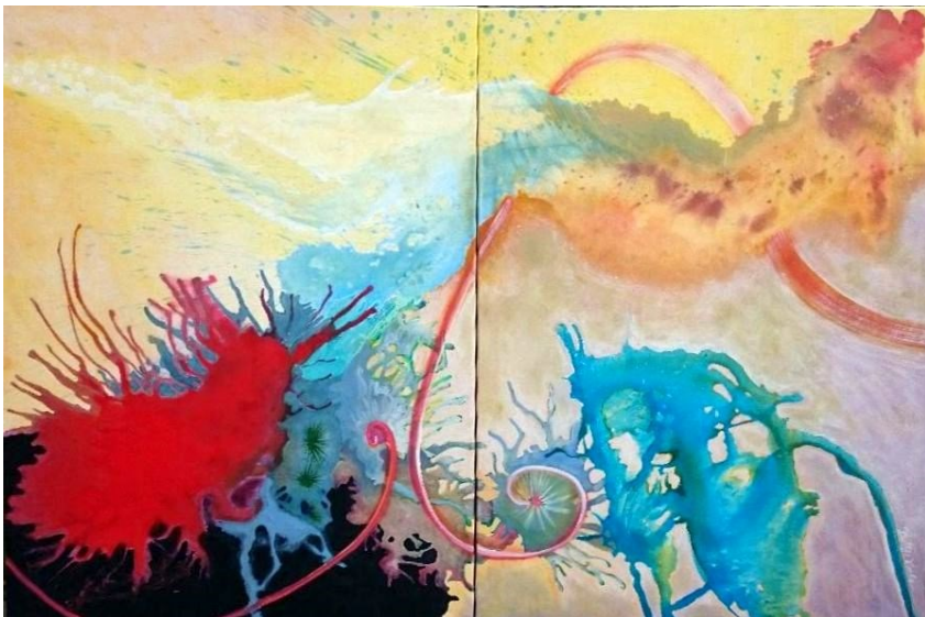
Where the Bee Sucks There Suck I