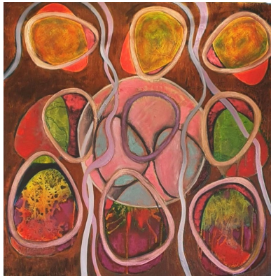
Eggy Float 104.5 x 104.5 cm Oil on canvas framed in Tasmanian oak. $2300