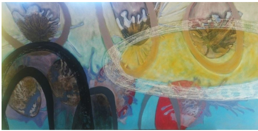
Mountains and Clouds 103 x 63.5 Oil on canvas framed in Tasmanian Oak $1800