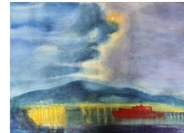
Aurora by Moonlight 91 x 71cm Full sheet watercolour framed in matte silver with art glass 1800