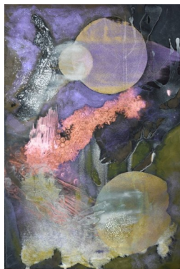
En Famille 71 x 53cm Mixed media on black Hahnmueller paper framed in gunmetal with art glass $750

Nolan Gallery Space 109 77 Salamanca Place Hobart 7004 03 62233449 0438446785 Www.nolanart.com.au Betty.nolan@bigpond.com