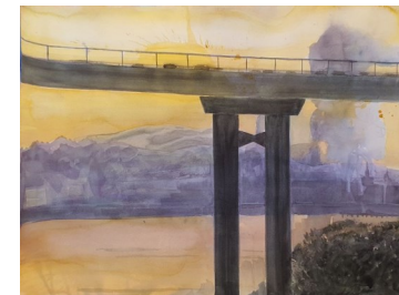
Yellow Tasman Bridge 91 x 71cm Full sheet watercolour framed in matte silver with art glass 1800