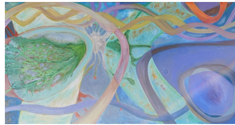
Derwent Drift 103 x 63.5 Oil on canvas framed in Tasmanian Oak $1800