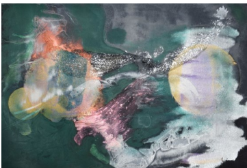
Embrace 71 x 53cm Mixed media on black Hahnmueller paper framed in gunmetal with art glass $750