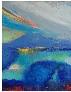
View from the Window 51 x 40cm Oil on canvas $795