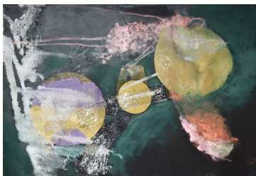
New Life 71 x 53cm Mixed media on black Hahnmueller paper framed in gunmetal with art glass $750