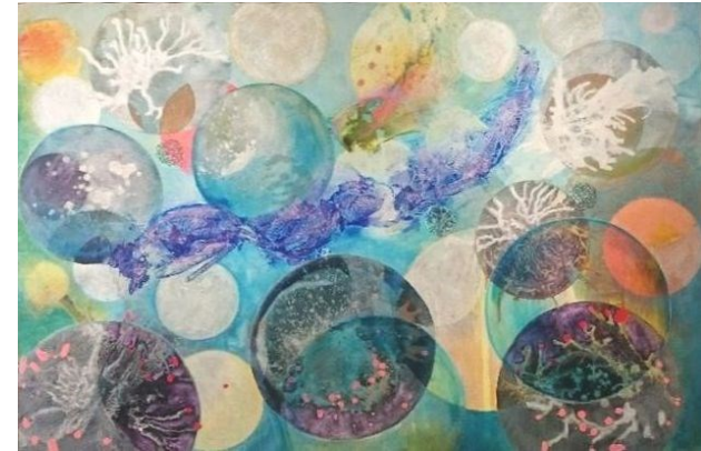
Bouyant Oil on canvas (fr) 1860 x 125cm, framed in white timber 6500