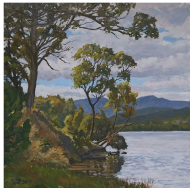
Castle Forbes Bay 76 x 76 cm

Oil on timber panel framed in Tas oak $2,700