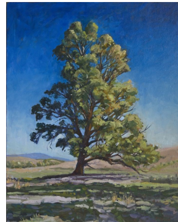
Pirouette 77 x 61

Oil on timber panel framed in Tas oak $1,750