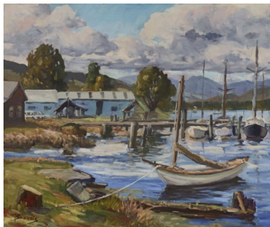
Sailing Dory, Franklin 51 x 61 cm

Oil on timber panel framed in Tas oak $3,200