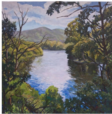
A Bend In the River 77 x 77 cm

Oil on timber panel framed in Tas oak $3,800