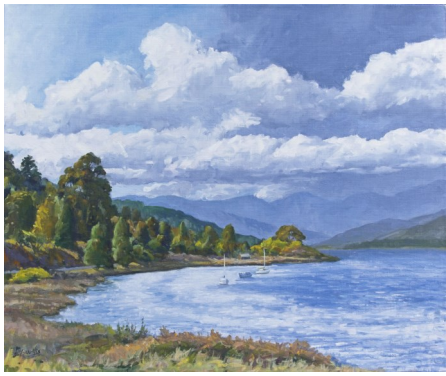
A Passing Shower 77 x 91 cm

Oil on timber panel framed in Tas oak $3,800