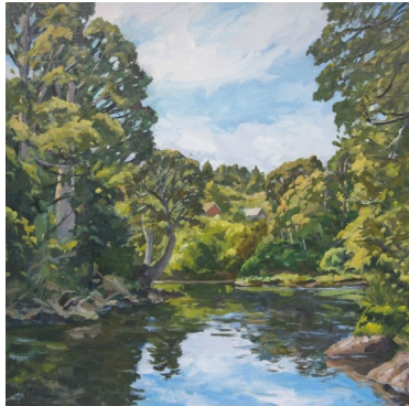
Huon River Ranelagh 76 x 76 cm

Oil on stretched canvas framed in Tas oak $4,500