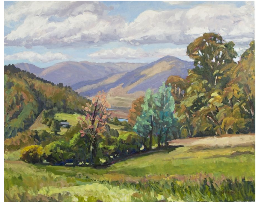
Valley View, Franklin 80 x 100 cm

Oil on timber panel framed in Tas oak $3,200