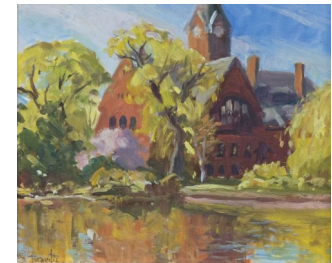
Spring Reflections 25 x 30cm

Oil on timber panel framed in Tas oak $2,600