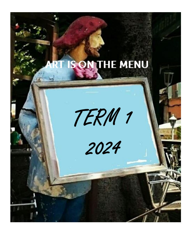
TERM 1 Adult classes, 2024 Tuesday Feb 13 to Friday April 12th