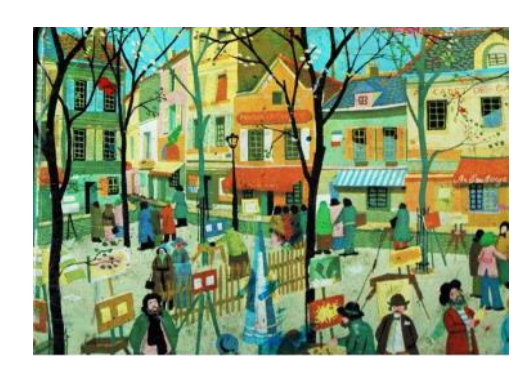
WEDNESDAY EVENING Modern Still Life with Jake Walker in 109 7 pm to 9pm