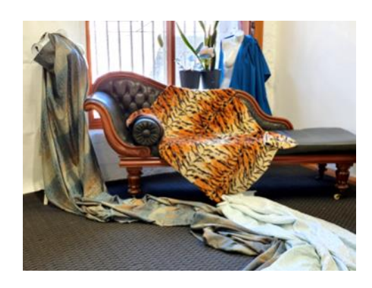
The Drawing Room