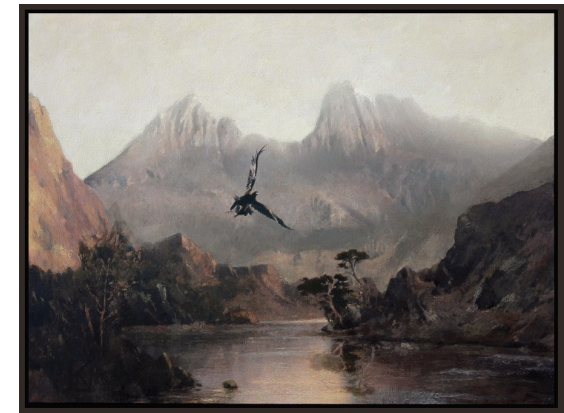
Cradle - Wedgetail

Oil painting on canvas, 80 x 120 cm, $5,900