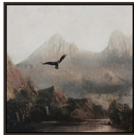
Cradle - Study

Oil painting on canvas, 40 x 40 cm, $1,400