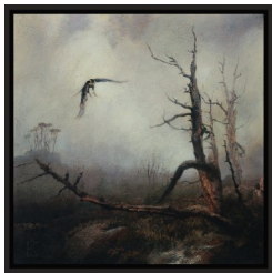
Pine Tree Lake-Study

Oil painting on canvas, 75 x 100 cm, $4,900