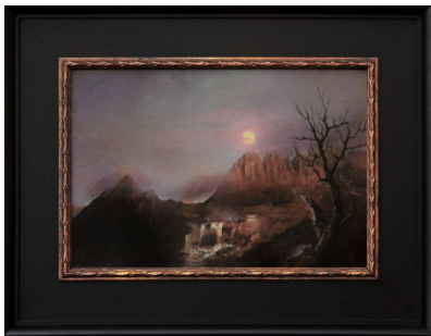
Blood Moon Oil painting on canvas, 25x 37 cm, $1,300