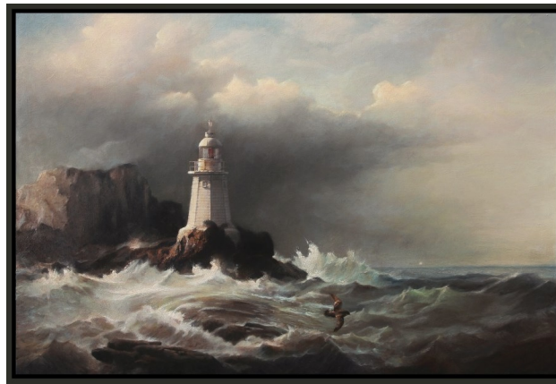
Storm off Hells Gates

Oil painting on canvas, 100 x 105 cm, $6,600