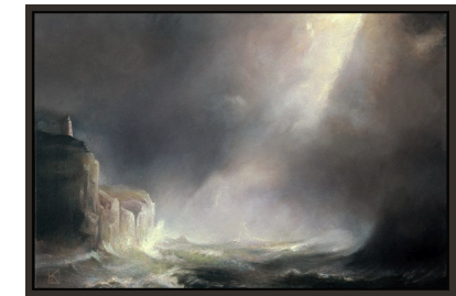
Storm off Bruny

Oil painting on canvas, 50 x 75 cm, $2,600