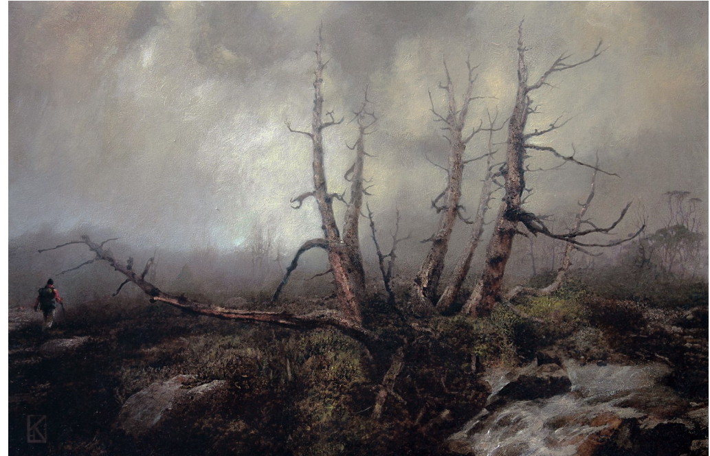
Pine Tree Lake Oil painting on canvas, 60 x 90 cm $3,750