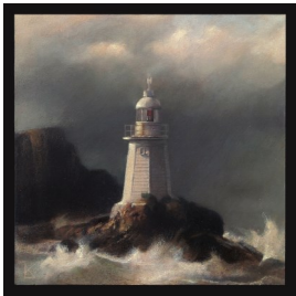
Storm Hells Gates-Study

Oil painting on canvas, 75 x 100 cm, $4,900