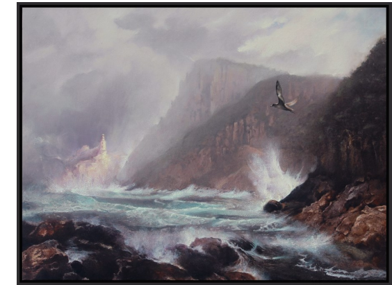
Coastal - Bruny

Oil painting on canvas, 65 x 56 cm, $2,600