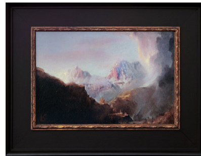
Sunrise-Cradle Oil painting on canvas, 25x 37 cm, $1,300