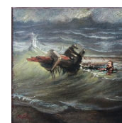
Hey! Look What I found Oil on canvas 30 x 30cm $990