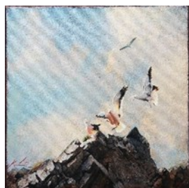
Gulls off Bruny Oil on canvas 30 x 30cm $990