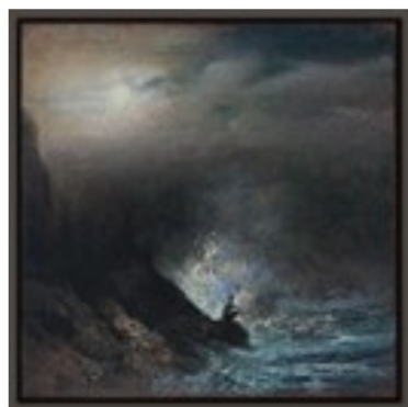
Contemplating the Moon Oil on canvas 40 x 40cm $1450