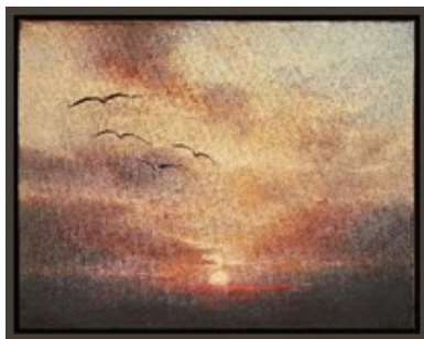
Departure – Sunrise Oil on canvas 40 x 50cm $1650