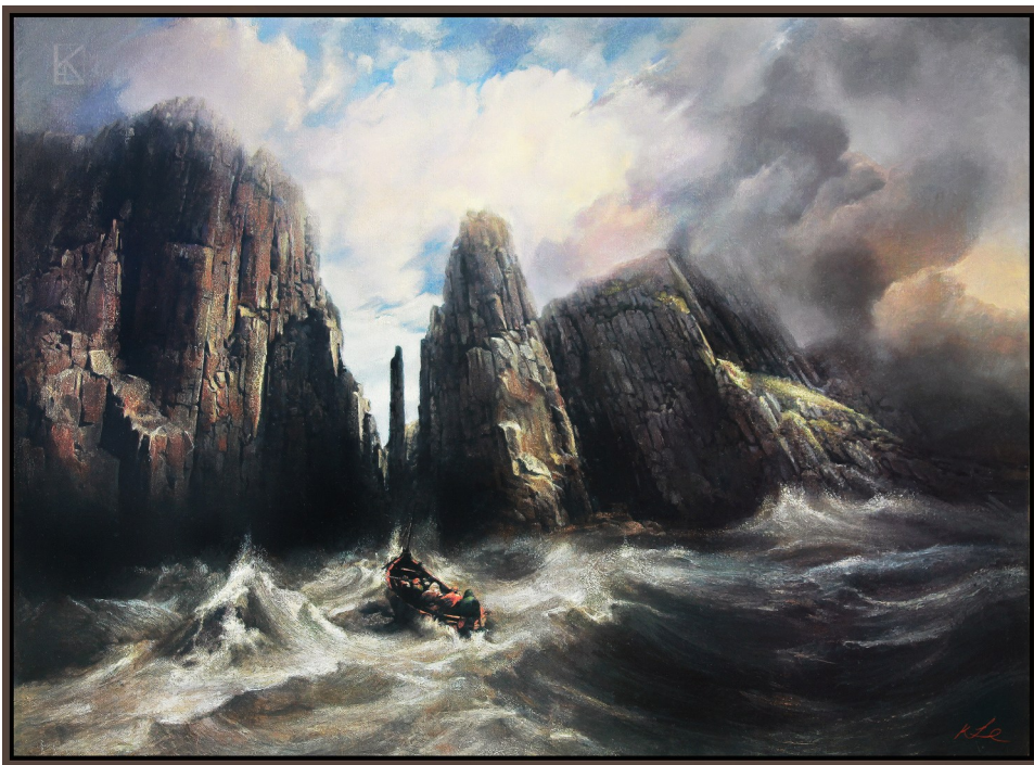
The Lanterns – Tasman Peninsular Oil on stretched canvas and framed 100 x 140cm $8450