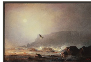
Distance – Tasman Island Oil on canvas 50 x 75cm $2450