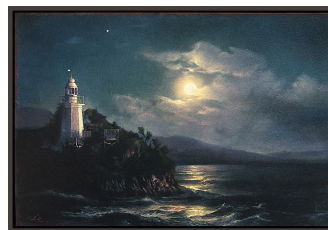
House of Light Oil canvas 50 x 75cm $2450