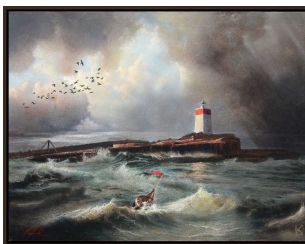
Iron Pot – Storm Bay Oil on canvas and 75 x 100cm $4950