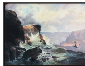
Crashing Waves Bruny Oil on canvas 57 x 75cm