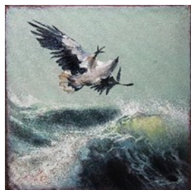
A Missed Catch Oil on canvas, 30 x 30cm $990