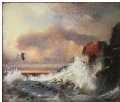
Bruny Wave Oil on canvas 40 x 50cm $1650