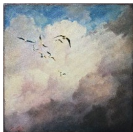
Gulls Overhead Oil on canvas, 30 x 30cm $990