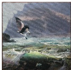
Sea Eagle Bruny Oil on canvas, 30 x 30cm $990