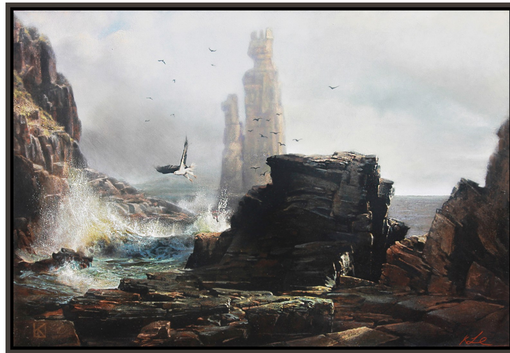
The Monument – Bruny Oil on stretched canvas and framed 80 x 120cm $5950