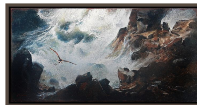
Homage to Achenbach Oil on canvas 30 x 60cm $1750